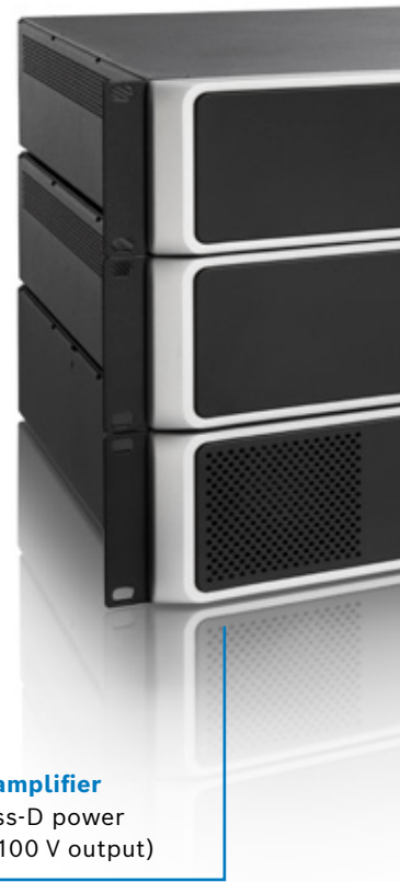
Two-channel amplifier 2 x 500 W class-D power amplifier (70/100 V output)